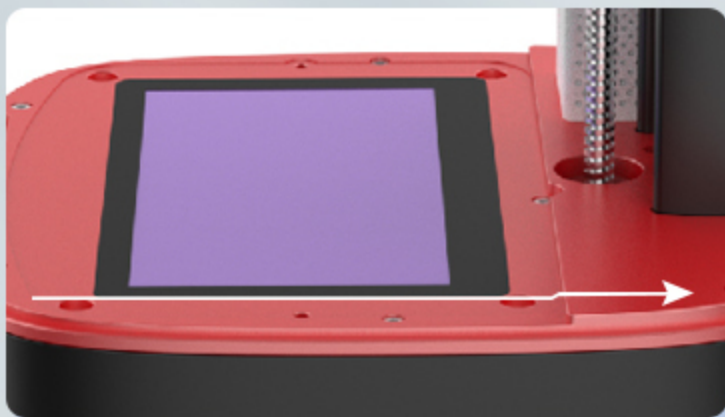
Prevent Resin Leakage from Damaging the Machine