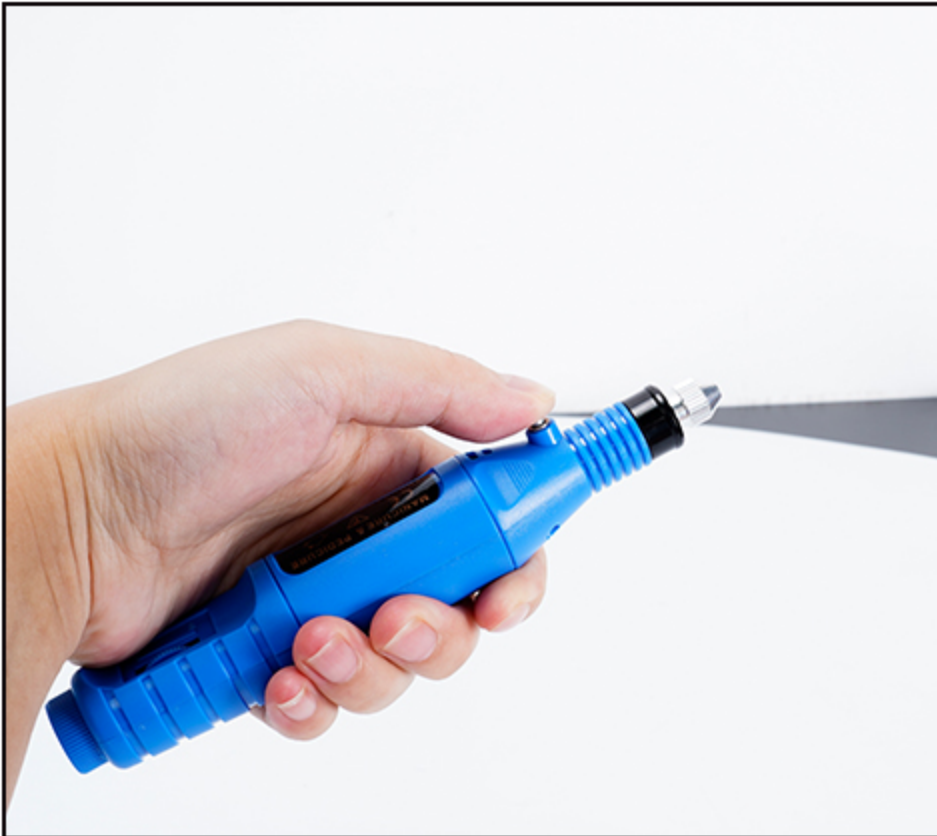
Step1:Press the positioning switch