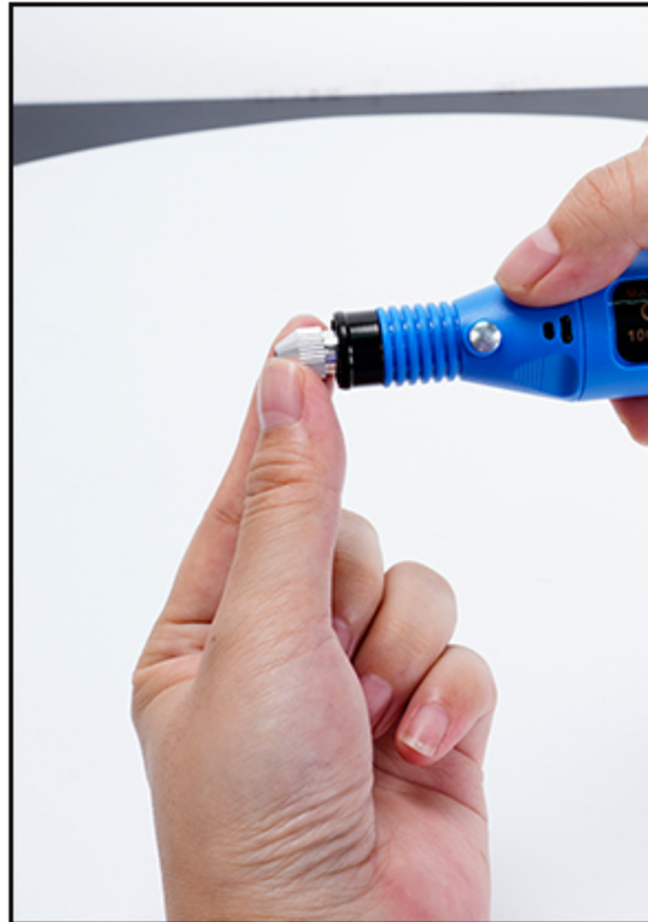
Step2:Loosen the retaining ring