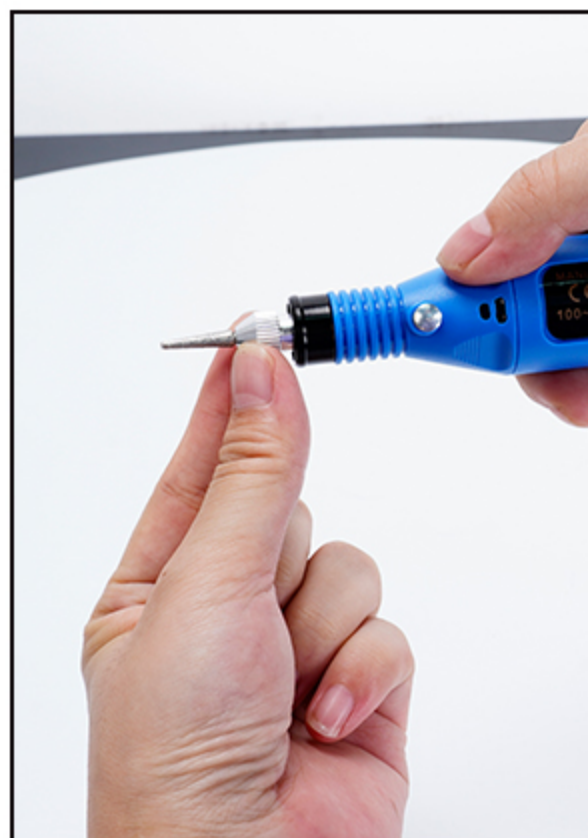
Step4:Tighten the retaining ring