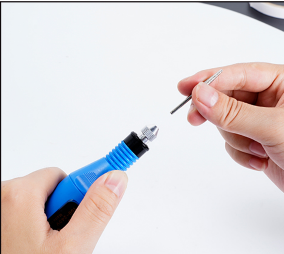
Step3:Insert the grinding head